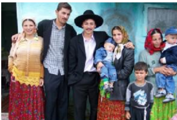
Part of the clan.